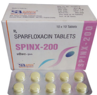
SPARFLOXACIN 200 MG TABLETS