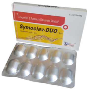
AMOXICILLIN 875 MG + CLAVULANIC ACID 125 MG TABLETS