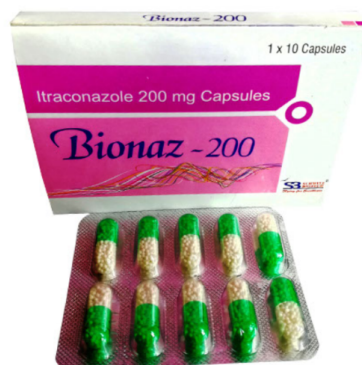
ITRACONAZOLE 200 MG CAPSULES