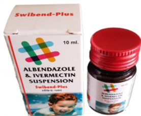
Albendazole 200 mg Ivermectin 1.5 mg