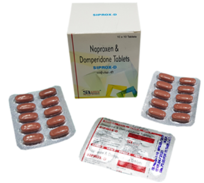
NAPROXEN & DOMPERIDONE TABLETS