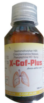
DEXTROMETHORPHAN HBR, CHLORPHENIRAMINE MALEATE, PHENYLEPHRINE HCl SYRUP