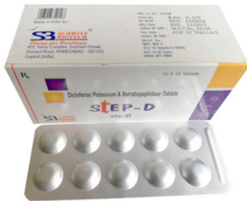
DICLOFENAC POTASSIUM 50 MG + SERRATIOPEPTIDASE 10 MG TABLETS