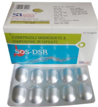
ESOMEPRAZOLE 40 MG (EC) + DOMPERIDONE 30 MG (SR) CAPSULES