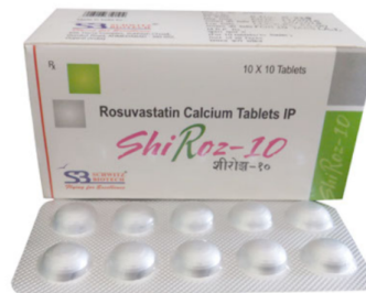
ROSUVASTATIN 10 MG TABLETS