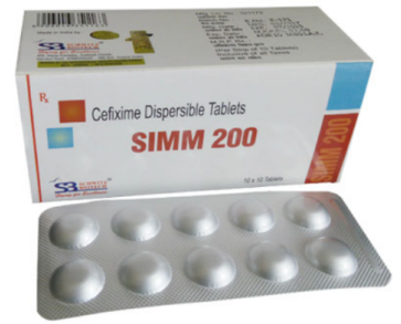
CEFIXIME 200 MG TABLETS