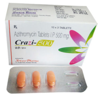
AZITHROMYCIN 500 MG TABLETS