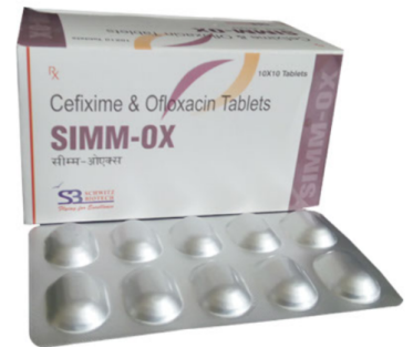
CEFIXIME 200 MG + OFLOXACIN 200 MG TABLETS