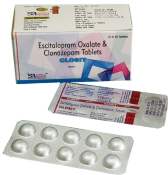
ESCITALOPRAM OXALATE + CLONAZEPAM TABLETS