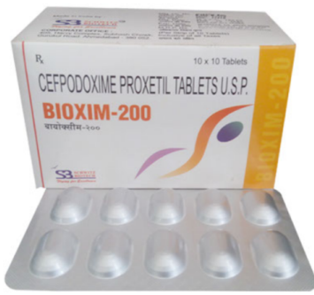
CEFPODOXIME PROXETIL 200 MG TABLETS