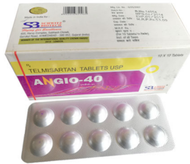
TELMISARTAN 40 MG TABLETS