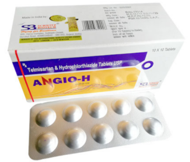
TELMISARTAN 40MG + HYDROCHLOROTHIAZIDE 12.5 MG TABLETS