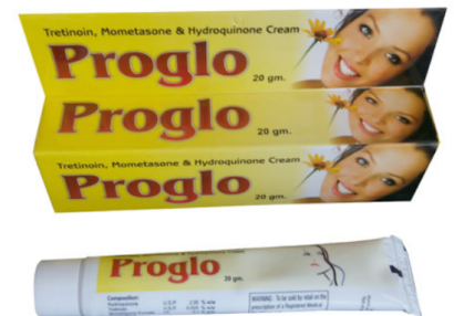
HYDROQUINONE 2%+ TRETINOIN 0.025% +MOMETASONE FUROATE 0.1% CREAM