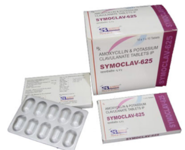
AMOXICILLIN 500 MG + CLAVULANIC ACID 125 MG TABLETS