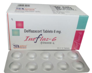
DEFLAZACORT 6 MG TABLETS