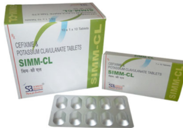
CEFIXIME 200 MG + AZITHROMYCIN 250 MG + LACTOBACILLUS SPECIES 60 MILLION TABLETS