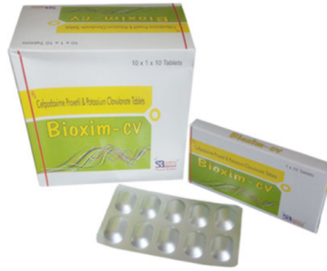
CEFPODOXIME PROXETIL 200 MG + POTASSIUM CLAVULANATE 125 MG TABLETS