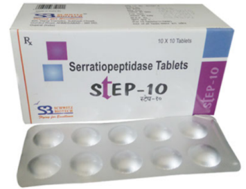
SERRATIOPEPTIDASE 10 MG TABLETS