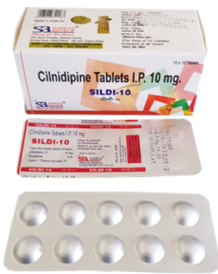
CILNIDIPINE 10 MG TABLETS