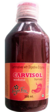
CARMINATIVE MIXTURE WITH DIGESTIVE ENZYMES