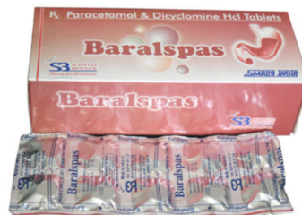
PARACETAMOL 500 MG + DICYCLOMINE 20 MG TABLETS