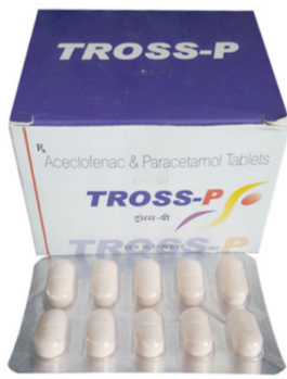
ACECLOFENAC 100 MG + PARACETAMOL 500 MG TABLETS