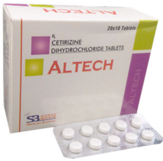
CETIRIZINE HCL 10MG TABLETS