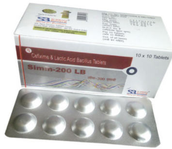
CEFIXIME 200 MG + LACTOBACILLUS SPECIES 60 MILLION TABLETS