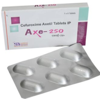
CEFUROXIME AXETIL 250 MG TABLETS