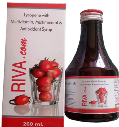
LYCOPENE + VITAMINS + ANTIOXIDANTS + MINERALS ZINC + IODINE SYRUP