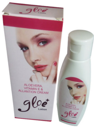
ALOE VERA + VITAMIN E + ALLANTOIN + TEA TREE OIL + HONEY + GLYCERIN MOISTURIZING FAIRNESS LOTION