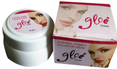
ALOE VERA + VITAMIN E + ALLANTOIN + TEA TREE OIL + HONEY + GLYCERIN MOISTURIZING FAIRNESS CREAM