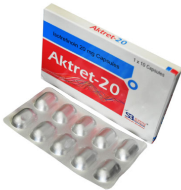
ISOTRETINOIN 20 MG CAPSULES