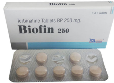
TERBINAFINE 250 MG TABLETS