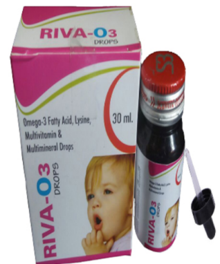
OMEGA 3 FATTY ACIDS + LYSINE + MULTIVITAMIN & MULTIMINERAL DROPS