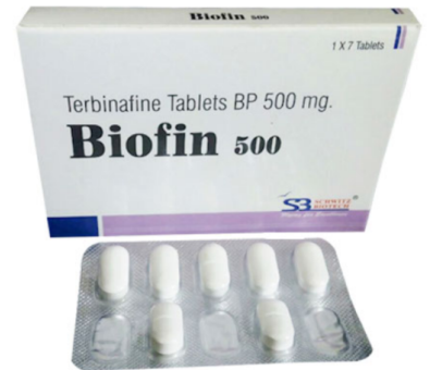
TERBINAFINE 500 MG TABLETS