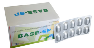
ACECLOFENAC 100 MG + PARACETAMOL 325 MG + SERRATIOPEPTIDASE 15 MG TABLETS