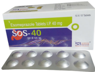
ESOMEPRAZOLE 40 MG TABLETS