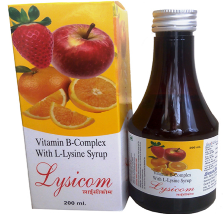
VITAMIN B-COMPLEX WITH L-LYSINE SYRUP