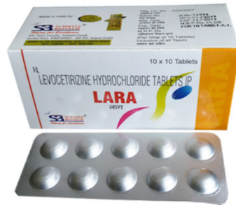
LEVOCETIRIZINE 5MG TABLETS