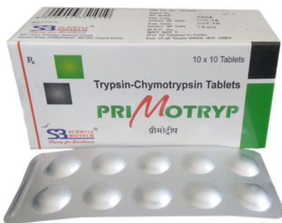
TRYPSIN- CHYMOTRYPSIN TABLETS