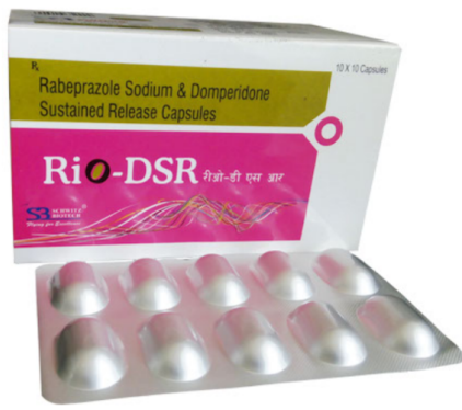
RABEPRAZOLE 20 MG + DOMPERIDONE 30 MG CAPSULES