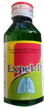
DEXTROMETHORPHAN HBR PHENYLEPHRINE HCL CHLORPHENIRAMINE MALEATE SYRUP