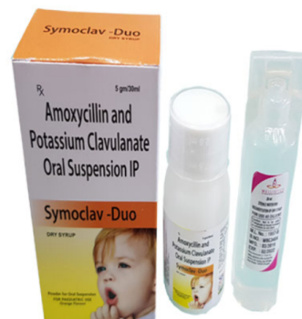
AMOXICILLIN AND POTASSIUM CLAVULANATE ORAL SUSPENSION