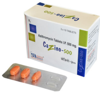
AZITHROMYCIN 500 MG TABLETS