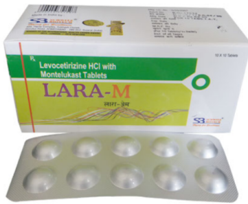
LEVOCETIRIZINE 5 MG + MONTELUKAST 10 MG TABLETS