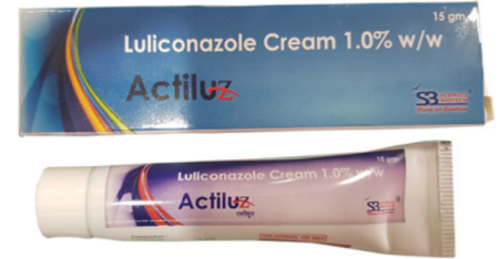
LULICONAZOLE 1% (10 MG) OINTMENT (CREAM)