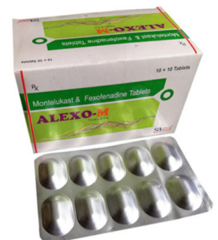
MONTELUKAST 10 MG + FEXOFENADINE HYDROCHLORIDE 120 MG