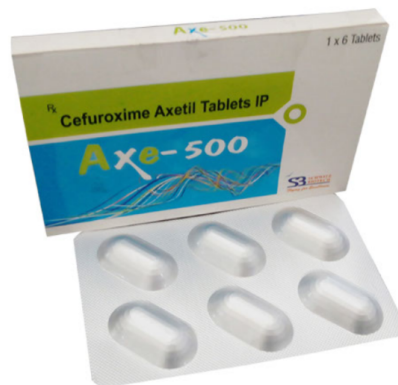
CEFUROXIME AXETIL 500 MG TABLETS