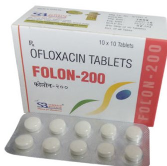
OFLOXACIN 200 MG TABLETS