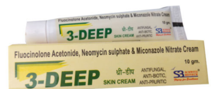
MICONAZOLE + NEOMYCIN + FLUOCINOLONE CREAM OINTMENT