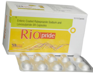
RABEPRAZOLE 20 MG + LEVOSULPIRIDE 75 MG CAPSULES