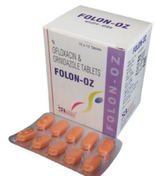
OFLOXACIN 200 MG + ORNIDAZOLE 500 MG TABLETS