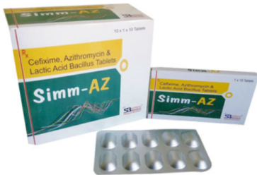
CEFIXIME 200 MG + AZITHROMYCIN 250 MG + LACTOBACILLUS SPECIES 60 MILLION TABLETS