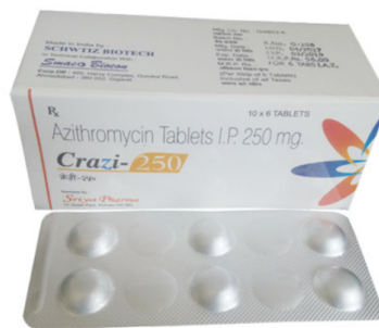
AZITHROMYCIN 250 MG TABLETS