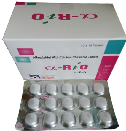
ALFACALCIDOL + CALCIUM / ALFACALCIDOL CALCIUM CHEWABLE TABLET 500 MG