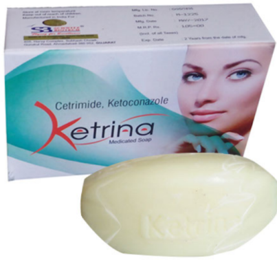
KETOCONAZOLE & CETRIMIDE SOAP