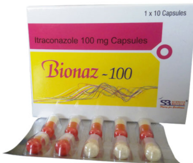
ITRACONAZOLE 100MG CAPSULES