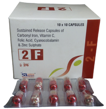
IRON + FOLIC ACID + VITAMIN C + ZINC CAPSULES