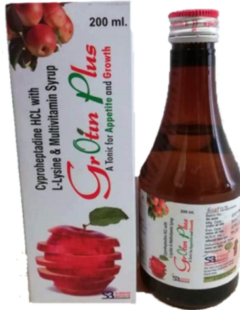
CYPROHEPTADINE HCL L-LYSINE MULTIVITAMIN SYRUP