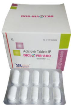
ACYCLOVIR 800 MG TABLETS