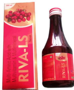
MULTI AMINO ACIDS WITH VITAMINS AND MULTI MINERALS SYRUP