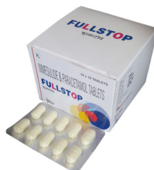
PARACETAMOL 500 MG + NIMESULIDE 100 MG TABLETS