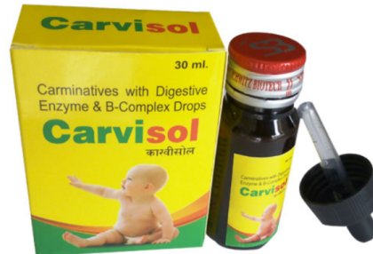
CARMINATIVE MIXTURE WITH DIGESTIVE ENZYMES & VITAMIN B-COMPLEX