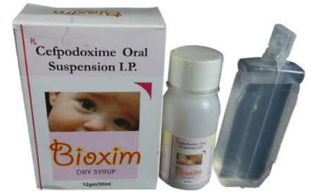
CEFPODOXIME PROXETIL 50 MG DRY SYRUP