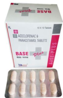
ACECLOFENAC 100 MG + PARACETAMOL 325 MG TABLETS