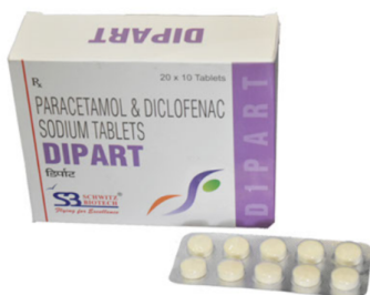
PARACETAMOL 500 MG + DICLOFENAC SOD. 50 MG TABLETS