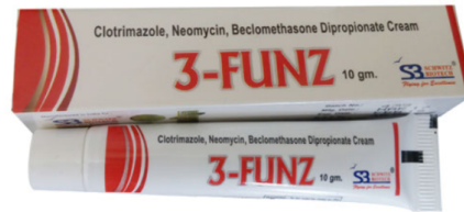
BECLOMETHASONE DIPROPIONATE 0.025% + CLOTRIMAZOLE 1% + NEOMYCIN SULPHATE 0.5% CREAM