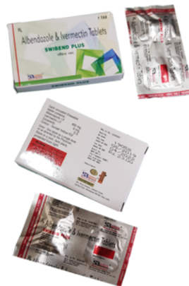
Albendazole 400 mg + Ivermectin 6 mg/12 mg