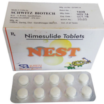
NIMESULIDE TABLETS 100MG